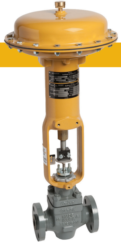
S&S BD/BT Series Valve